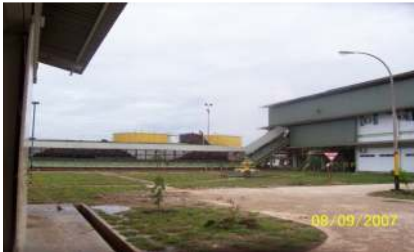
LOADING RAMP VIEW