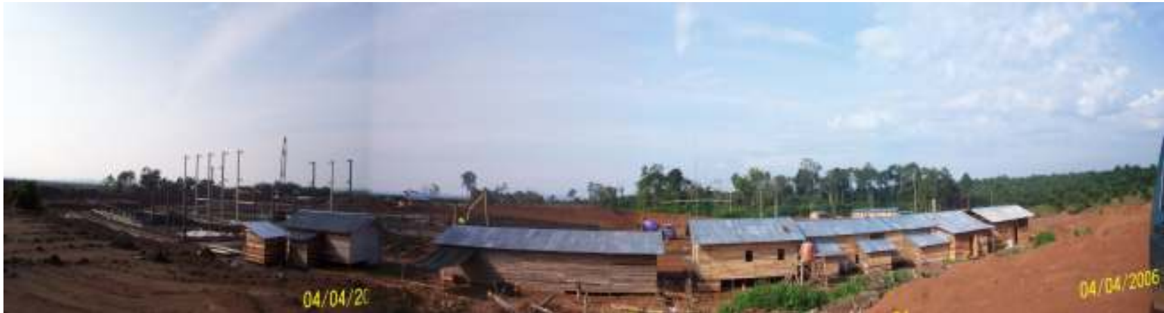
UNDER CONSTRUCTION START END 2005