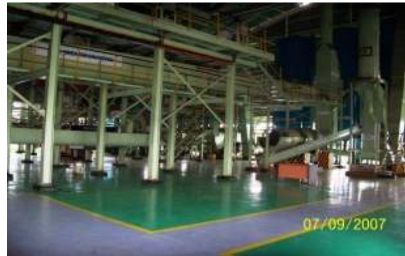
KERNEL STATIONS AFTER 9 ( NINE ) MONTH OPERATION